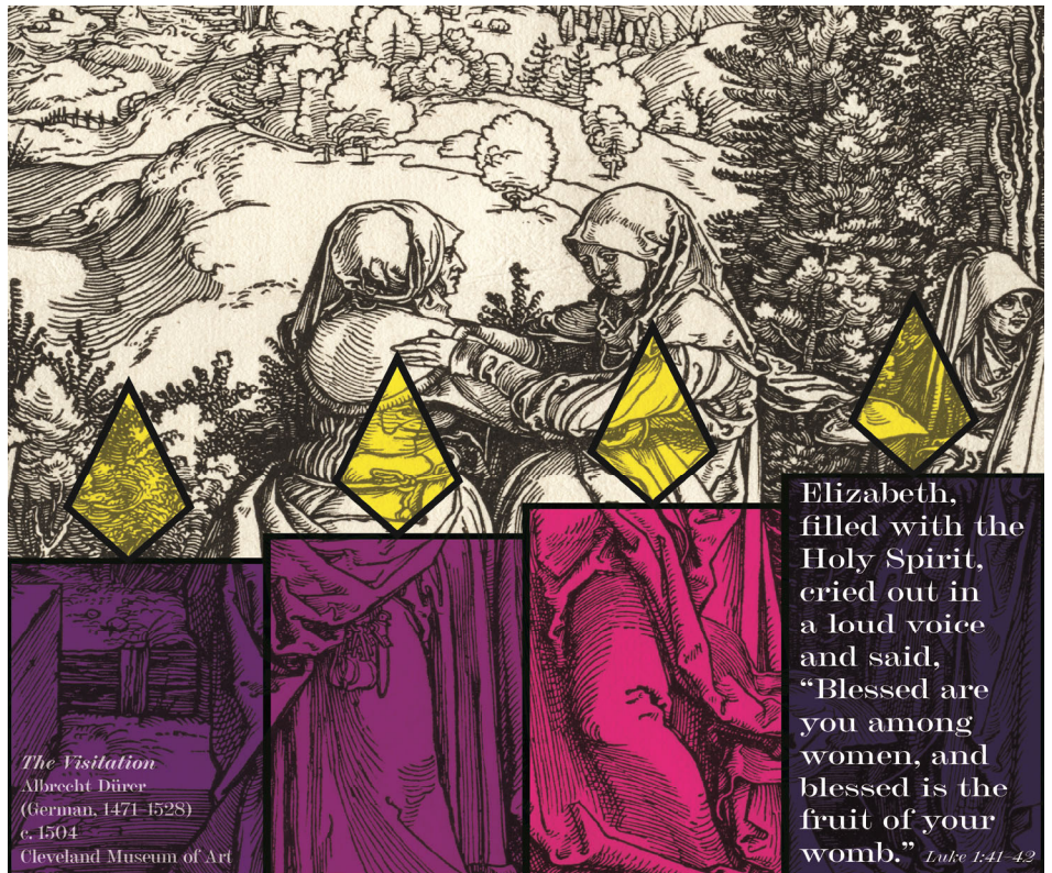
The Visitation Albrecht Dürer (German, 1471-1528) c. 1504 Cleveland Museum of Art

Gospel — Blessed are you who believed that what was spoken by the Lord would be fulfilled (Luke 1:39-45).