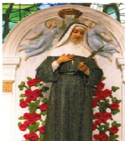
St. Rita of Cascia is the Patroness of the Impossible

Veneration of the Relic of St. Rita will be available daily. Healing Mass and a Blessing with the St Rita Oil on May 21st; Blessed roses will be distributed on the Feast Day Masses on May 22nd.